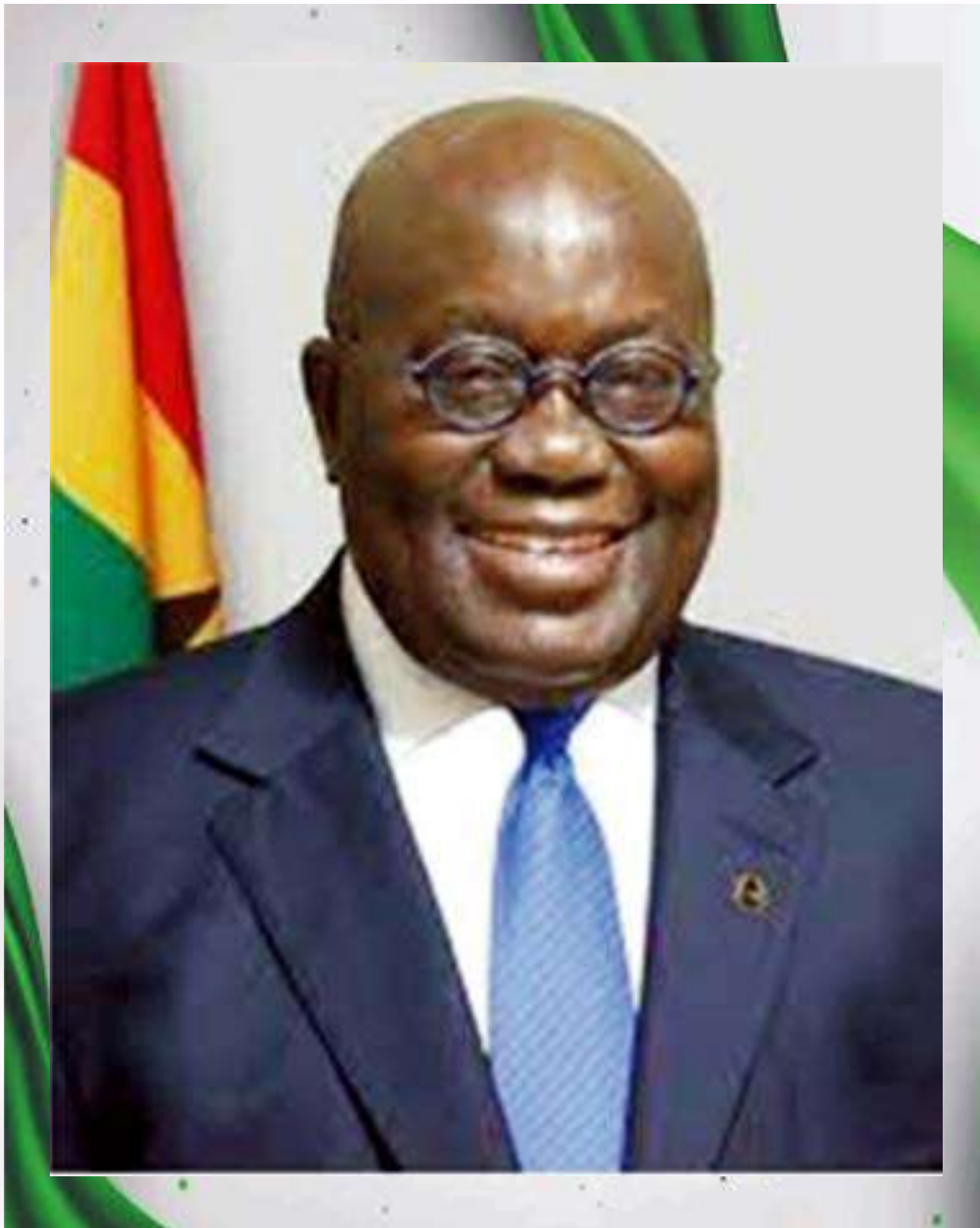
His Excellency NANA AKUFO-ADDO, CCGAF President Federal Republic of Ghana